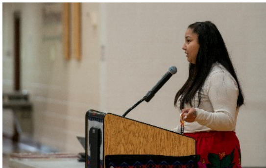
Nisqually Tribe 5th Council addressed attendees about her own experience with MMIWP.

The next summit will be announced soon, with dates for registration a few months ahead of time. Participation from anyone that can make it is welcome and needed.